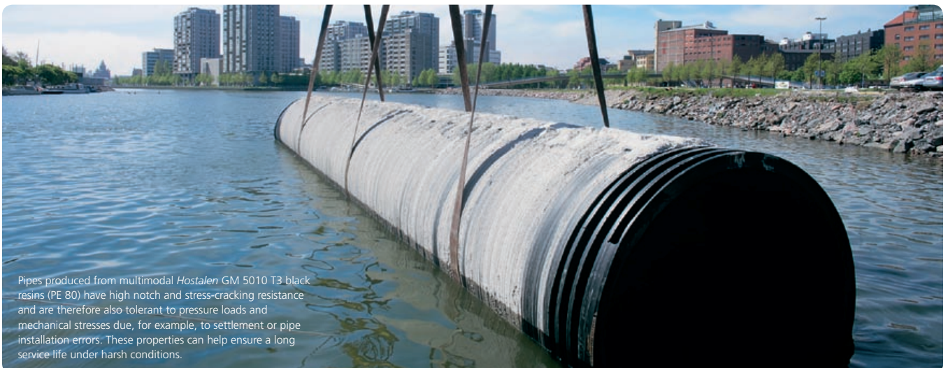
Pipes produced from multimodal Hostalen GM 5010 T3 black resins (PE 80) have high notch and stress-cracking resistance and are therefore also tolerant to pressure loads and mechanical stresses due, for example, to settlement or pipe installation errors. These properties can help ensure a long service life under harsh conditions.

Laboratory quantities of individual pipe systems made from HDPE by former Hoechst AG in Frankfurt have been subjected to