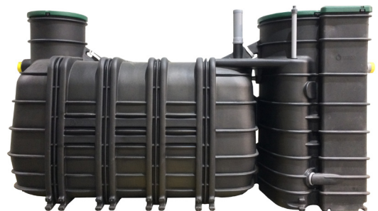
Courtesy Biorock tank, Rotomade

Icorene 1440 is a hexene based highdensity (HDPE) Polyethylene processed using a proprietary catalysis system. At 10% Igepal, this exclusive grade has excellent ESCR (Environmental Stress Crack Resistance) and easily exceeds 1.000 hours. Icorene 1440 is designed for use in large tanks, including agricultural and chemical storage containers, due to its superior performance in ARM impact resistance at -40°C.