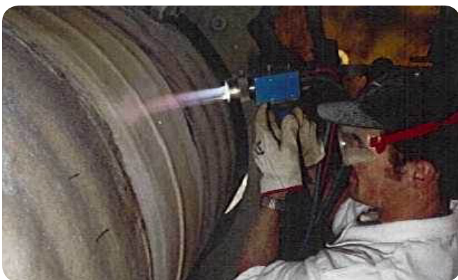
Flame-spray System.

Hifax EPR 60 Bianco pellet is used by Pipeline Induction Heat Limited to produce their PP tape-wrap field-joint coating.